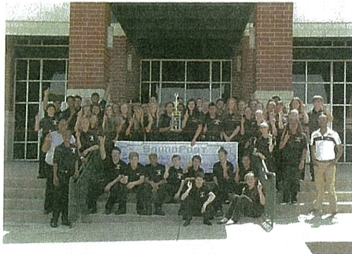
Westwood Jr. High Band received a Superior Rating of a 1 at the Sound Post Music Festival